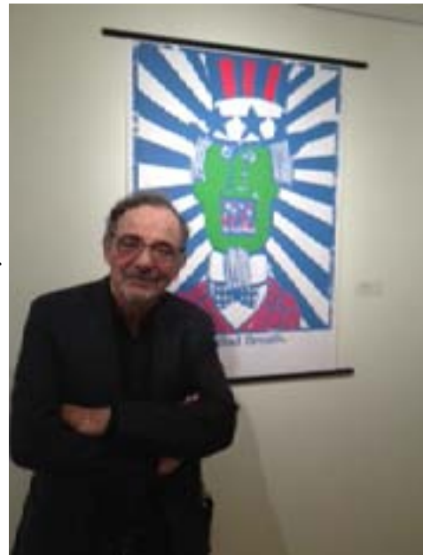
Seymour Chwast posing with his work titled "End Bad Breath"