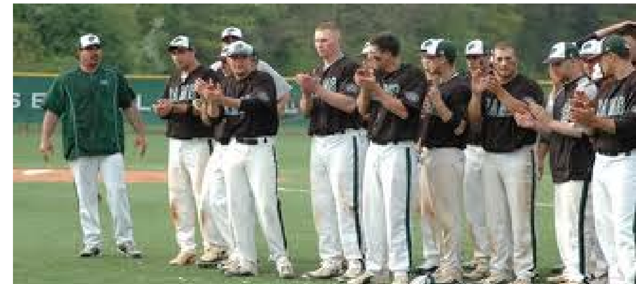
Farmingdale State Ram's Mens Baseball Team

After a rocky beginning for the Farmingdale State Ram's men's baseball team, the squad is finally beginning to get it together at a rapid pace. Starting the season 0-4 was a shocker during the start of their 2013 spring season, but they have redeemed themselves and are now holding a 14-9 record along with an impressive 7-1 record in the conference.