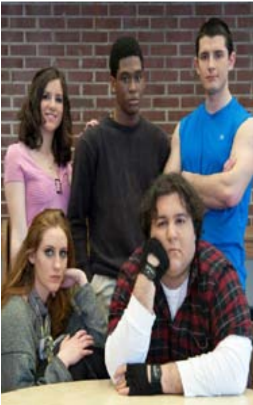
The Cast of The Breakfast Club

Detention hits the stage this spring. Members of The Backstage Theatre Company at Farmingdale State College have been rehearsing four days a week, two and a half hours a night for their April spring drama, a live onstage production of the movie, "The Breakfast Club." Set in 1984, the movie focuses on five very different teenagers who are forced to spend an eight-hour Saturday detention together.