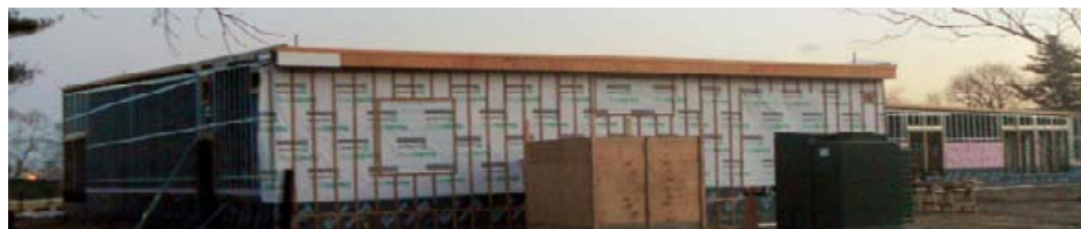
New Children's Center to open near the Route 110 entrance

Take a walk around the Farmingdale campus and you will quickly notice the countless construction projects that are taking place. One of these new projects is a brand new Children's Center that is expected to open in November 2013.