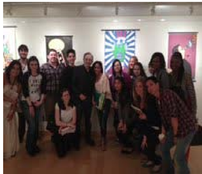
Journalism students with Seymour Chwast

Switching over to the "her" side of the exhibit, was Cooper Union College alumni, Seymour Chwast. The Cofounder of Push Pin Studios, now director of the Push Pin Group, shared that his wife Paula Scher, partner of Pentagram in Manhattan was unable to attend the exhibit. "My wife and I are actually competitors. We have no art work together, we work for two different art studios," said Chwast.