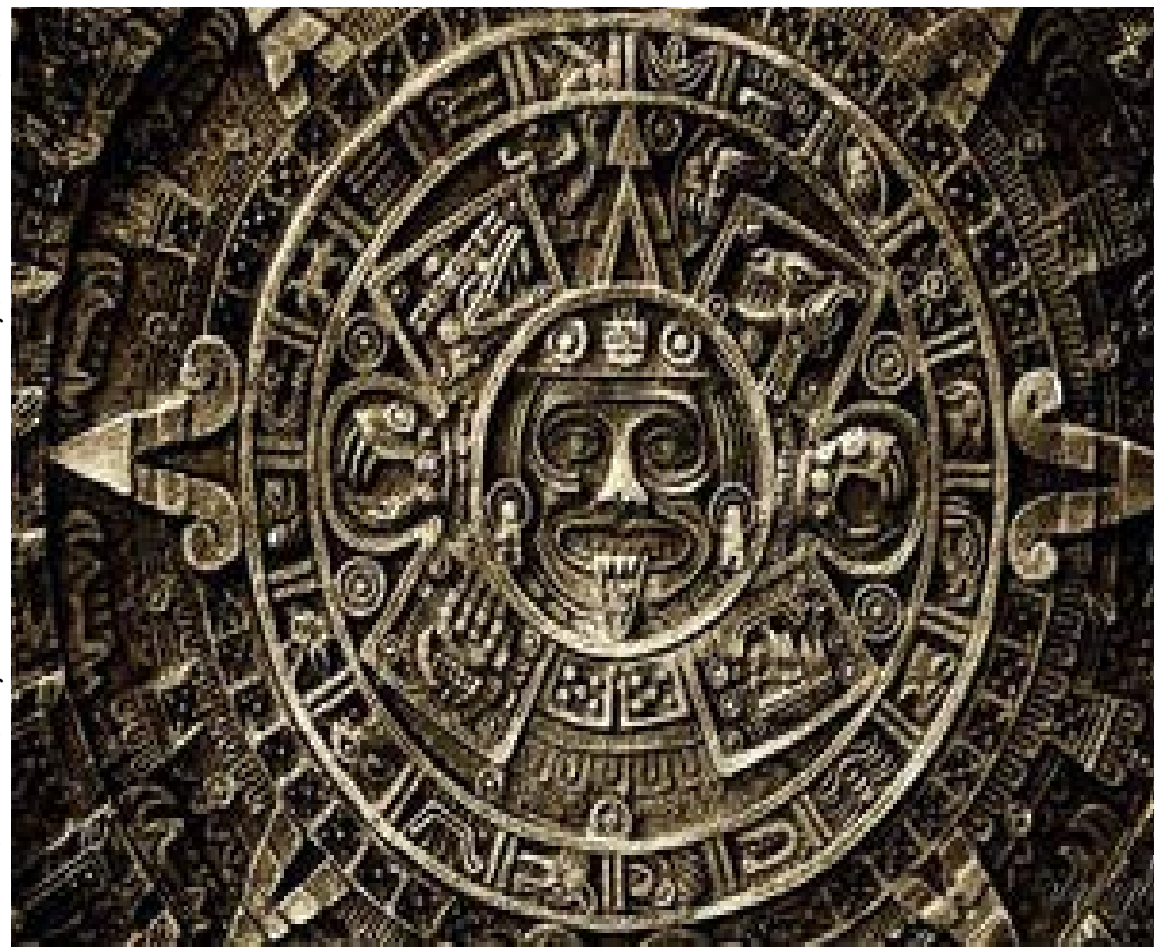
Mayan Long Count Calendar

The painting depicted Hona Hau standing beneath a gigantic tree. The tree branches were weighed heavily down by a large macaw who was standing on top of the tree while in a war with the Mayan king. Ultimately,