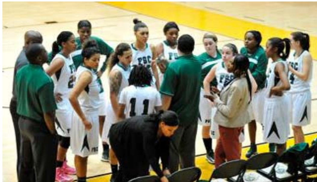
The Rams womens team huddled up

The Farmingdale State women's basketball team has proven they are a team of strength, agility, and determination as they won the Skyline Conference of the year and entered the NCAA Division III Tournament after they defeated Purchase, 40-39.