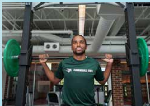
Nold Hall's fitness center and athletic facilities are world class.