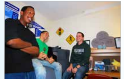
More than 600 students live on campus.