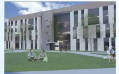
The new School of Business Building opens this summer.