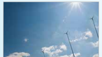
Three campus wind turbines contribute to the campus electric grid and are managed by the Renewable Energy and Sustainability Center.