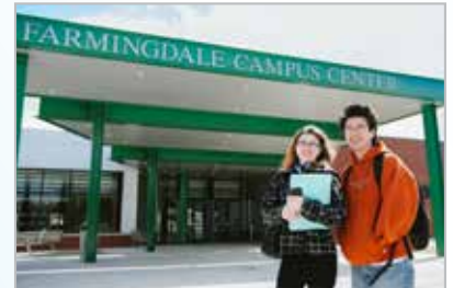
Our Campus Center is a hub of activity.

Learn about programs and services designed to assist students and families pay for college. Important financial aid deadlines, how to fill out the FAFSA application, scholarship and other financial opportunities available to students will be discussed.