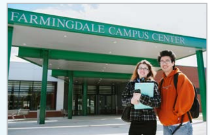
Our new Campus Center opened in January 2013.