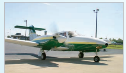
Sixteen Piper aircraft and seven Cessna aircraft serve as our professional pilot training fleet at the Aviation Center.