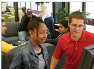
The Student Success Center is designed to provide students with all the support they need to reach their academic goals.

An admissions counselor will explain entrance requirements for Nursing.