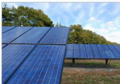
The Solar Energy Center provides energy to the campus and offers students unique research opportunities.