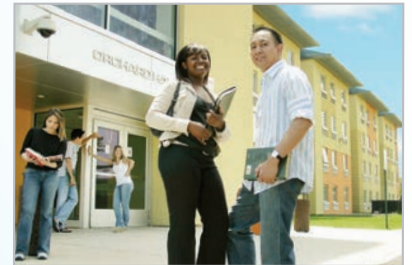
Orchard Hall, the college's first new residence hall building in 35 years, houses 408 students.