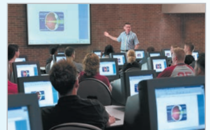
Technology Enhanced Classrooms, like this one in Greenley Hall Library, allow professors to deliver lectures using the latest technology.