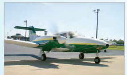
Sixteen Piper aircraft and seven Cessna aircraft serve as our professional pilot training fleet at the Aviation Center.