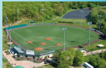
Recently completed athletics construction projects include a new baseball stadium, tennis courts and quarter-mile track.