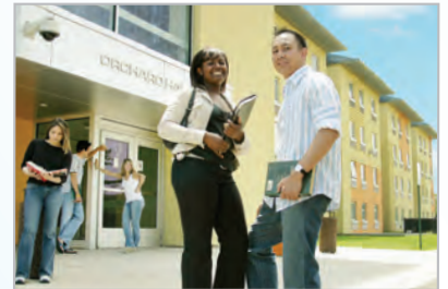
Orchard Hall, the college's first new residence hall building in 35 years, houses 408 students.

Campus and Residence Hall Tours - Take a walking tour of the most popular areas on campus including a newly renovated residence hall. Please note that our student-led tours are very popular and there may be a wait during peak times. Specific department tours are also being offered; please see the School Tours section below for more information.