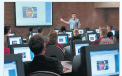
Technology Enhanced Classrooms, like this one in Greenley Hall Library, allow professors to deliver lectures using the latest technology.