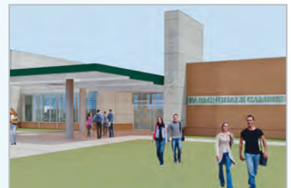
Our new Campus Center will open in early 2013.

Mechanical Engineering Technology - Lupton 194