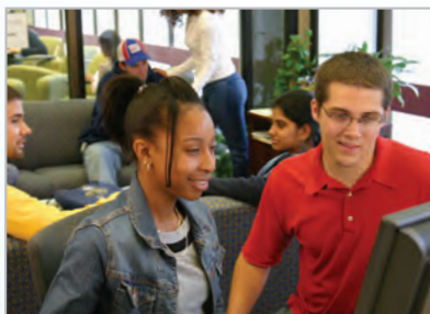
The Student Success Center is designed to provide students with all the support they need to reach their academic goals.

An admissions counselor will explain entrance requirements for Nursing.