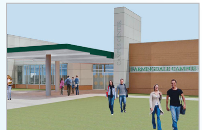
Our new Campus Center will open in early 2013.

Mechanical Engineering Technology - Lupton 194