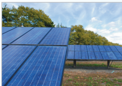
The Solar Energy Center provides energy to the campus and offers students unique research opportunities.