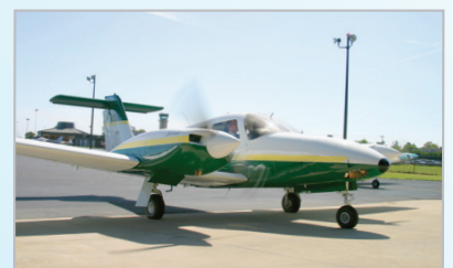
Sixteen Piper aircraft and seven Cessna aircraft serve as our professional pilot training fleet at the Aviation Center.