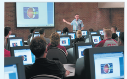
Technology Enhanced Classrooms, like this one in Greenley Hall Library, allow professors to deliver lectures using the latest technology.