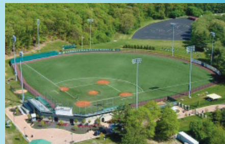
Recently completed athletics construction projects include a new baseball stadium, tennis courts and quarter-mile track.