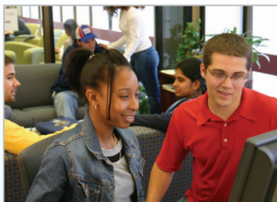
The Student Success Center is designed to provide students with all the support they need to reach their academic goals.

An admissions counselor will explain entrance requirements for Nursing.